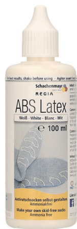
Nr.: 9824121-00004 white