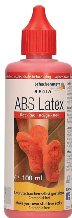
Nr.: 9824121-00002 red

milk just needs sufficient time to dry and then the individually designed stopper socks will be ready for the whole family. Available in colors red, white and black in the 100 ml dosing bottle.