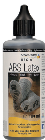
Nr.: 9824121-00001 black